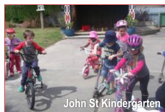
John St Kindergarten